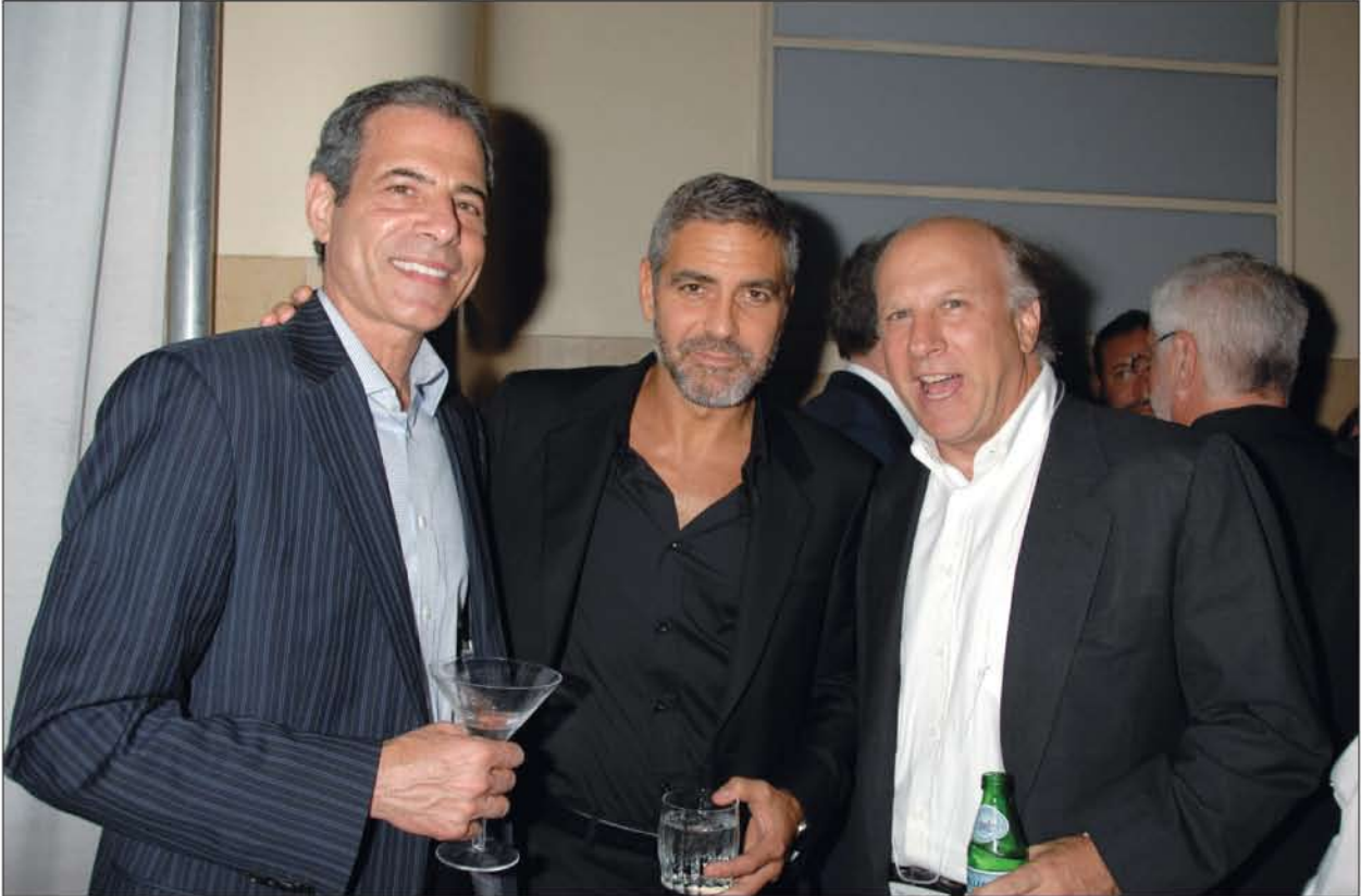
George Clooney enjoys the party to promote his new movie, “Michael Clayton”

Award-winning condominium developer TAS DesignBuild recently teamed with TIME Canada to design the venues for a series of parties as part of TIME’s Cinematic Events program. These successful gatherings at popular Toronto venues showcased fabulous films and a spectacular collaboration between the two companies. The star-studded events were attended by an amazing cast of glitterati that included George Clooney, Danny Glover, Donald Sutherland and Leelee Sobieski.