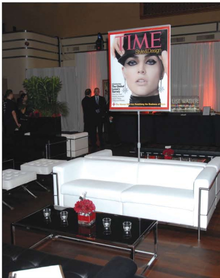
Design was the co-star at party for the new movie “Michael Clayton” during the recent Film Festival