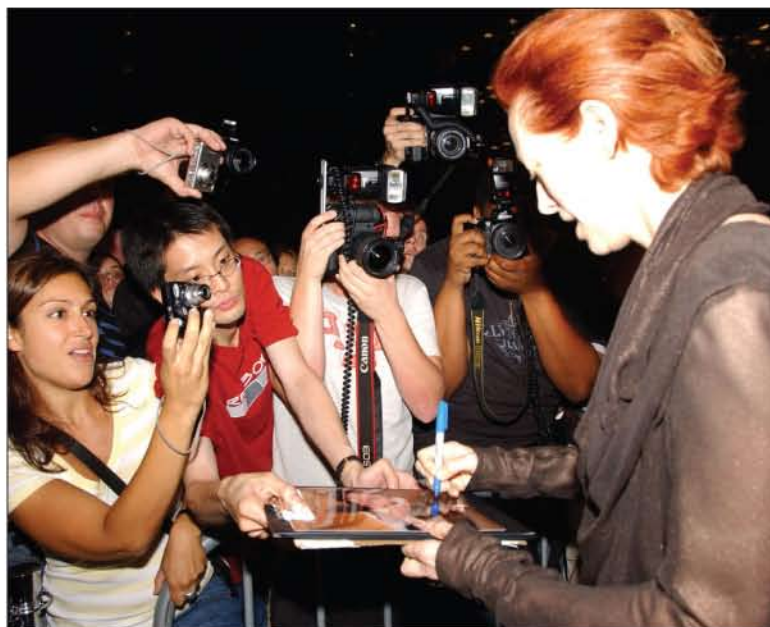
Tilda Swinton, star of the new movie titled “Michael Clayton,” greets her excited fans as she arrives at the star-studded party